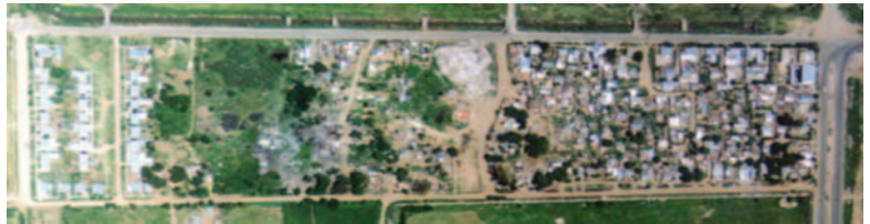
FIGURE 3 La Lagunita (2002)

Interviews with the people targeted by the programme, after the intervention was complete, showed that 75 per cent appreciated the