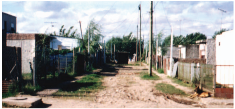
PHOTO 2 Settlement Hardoy in the municipality of San Fernando, in the west of Greater Buenos Aires, before improvements brought about by the Promeba programme