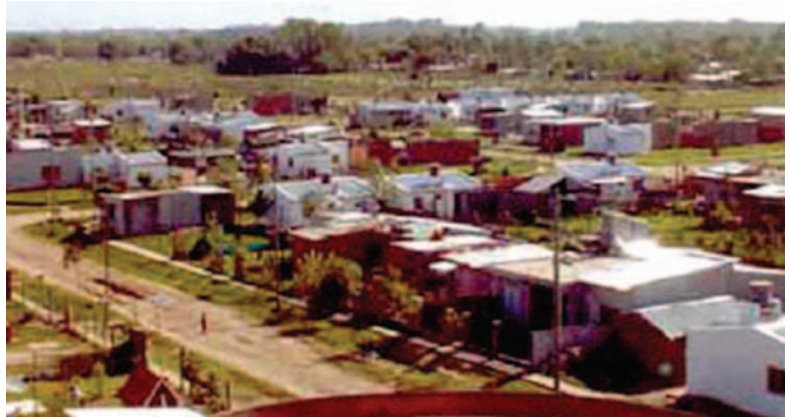
PHOTO 1 Settlement El Milenio in the municipality of Moreno, in the west of Greater Buenos Aires

Most precarious or informal settlements occupy land illegally, often land that is abandoned or disputed. However, some informal settlements are built on illegal sub-divisions (often termed popular plots), where the land was purchased from the landowner.