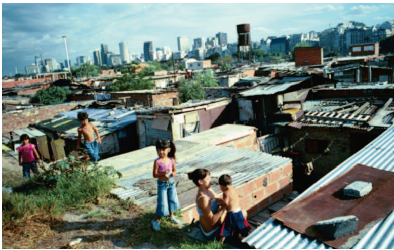
PHOTO 4 Villa 31 Retiro in the city of Buenos Aires