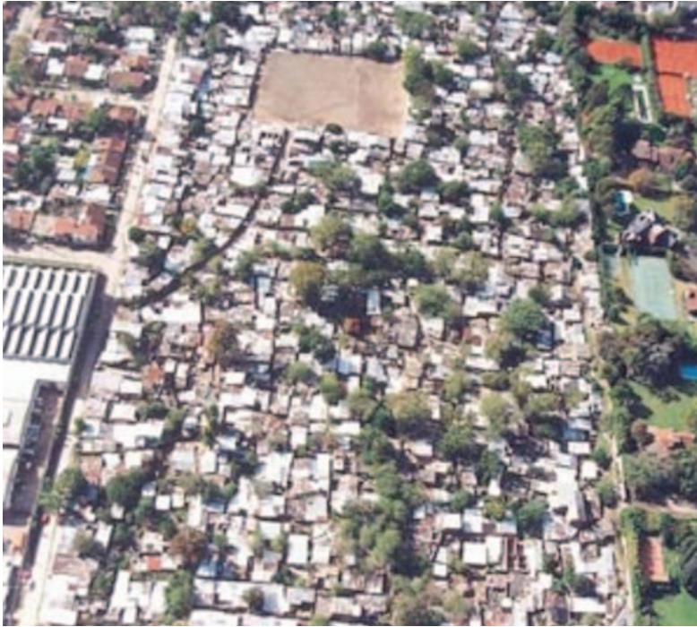
PHOTO 3 Villa la Cava in the municipality of San Isidro, in the north of Greater Buenos Aires