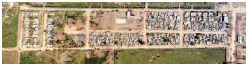
FIGURE 4 La Lagunita (2005)